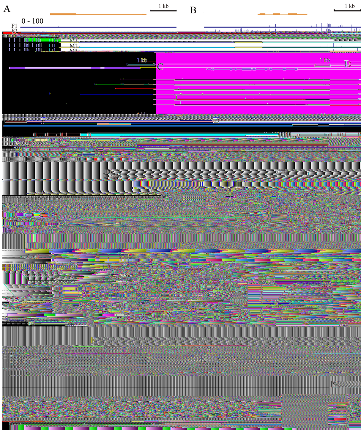
Fig. 3. DNA methylation profiles of sex-related genes. A-I The methylation profiles of Foxl2 , Dmrt , Sry , Sox9 , Fem1c , Nanos1 , Insr , Vg and Stpg2 . J The FPKM of nine genes related to sex in female gonads (FG) and male gonads (MG). K, L Validation of Dmrt methylation in females and males, respectively. M MSP analysis of Dmrt , Insr , Stpg2 and Vg . Primer sets used for amplification are designated as methylated in females (MF) or males (MM) and unmethylated in females (UF) and males (UM). M represents marker. The gray box indicates the DMRs area in A-I .