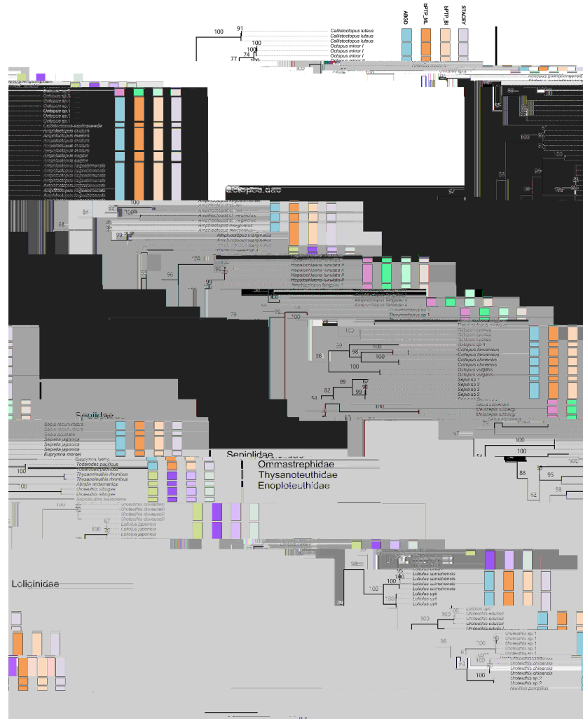
FIGURE 2 | Summary of species delimitation results via Species Tree and Classification Estimation Yarely, automatic barcode gap discovery, and Bayesian Poisson tree processes model. The phylogenetic structure was induced by the Maximum Likelihood tree. Each column with a different color represents a species detected by molecular delimitation. The number in each node represents the bootstrap values.

The MOTUs identified by the three different methods were highly overlapped. ABGD provides three distance measuring methods—Jukes–Cantor (JC69), Kimura (K80), and simple distance (SD)—for species delimitation, and the results could be varied with different prior intraspecific divergence ( P ). After partitioning, all three methods implemented in ABGD yielded the same MOTUs of 55 at the minimum P of 0.0129 (Figure 2). Five morphospecies, L. beka , U. edulis , A. fangsiao , H. lunulate , and O. minor showed two MOTUs inferred by ABGD. Consistently, STACEY assigned 1,665 trees (92.45%) from all the samples into the same 55 MOTUs (Figure 2). As shown in Figure 2 and Supplementary Figure 1, the phylogenetic trees based on Bayesian and maximum likelihood methods present an inconsistent topological structure, with the Bayesian tree splitting in Loliiginidae. According to bPTP, 56 MOTUs were detected based on the tree generated by the Bayesian method